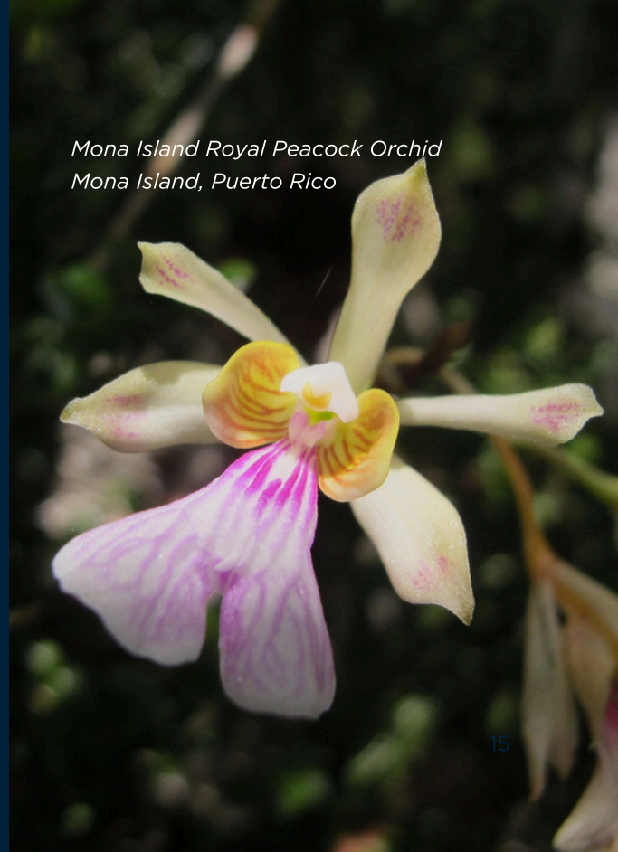
Monarch Island Royal Peacock Orchid Monarch Island, Puerto Rico