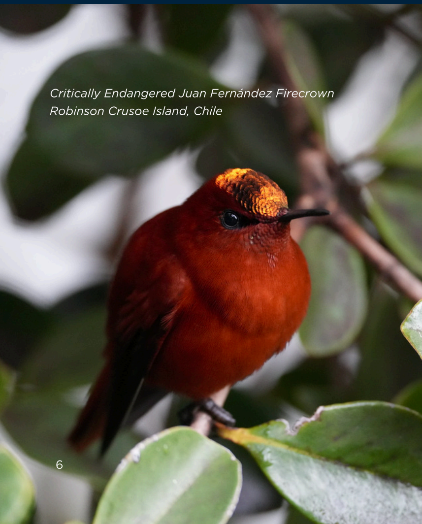
Critically Endangered Juan Fernández Firecrown Robinson Crusoe Island, Chile