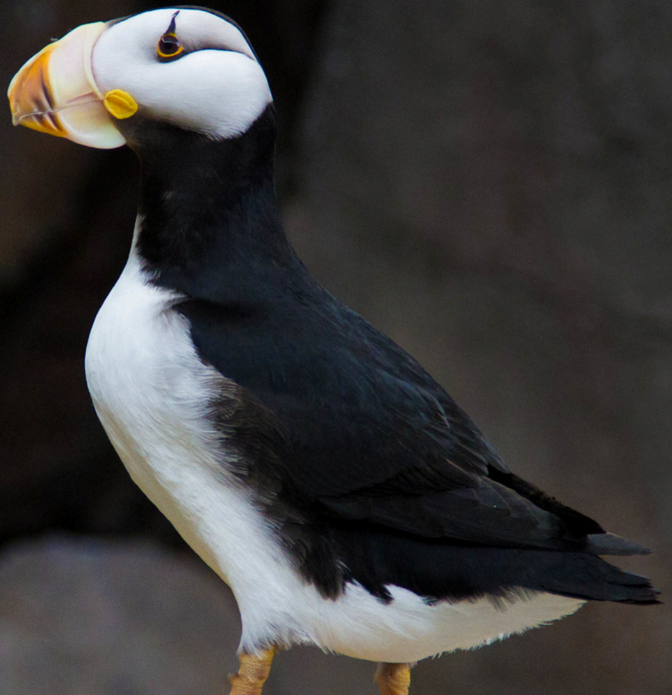
Horned Puffin Hawadax Island, Alaska

"I give to Island Conservation, a nonprofit corporation currently headquartered in Santa Cruz, CA, _____ [written amount or percentage of the estate or description of property] for its unrestricted charitable use and purpose. Tax ID # 91-1839907."