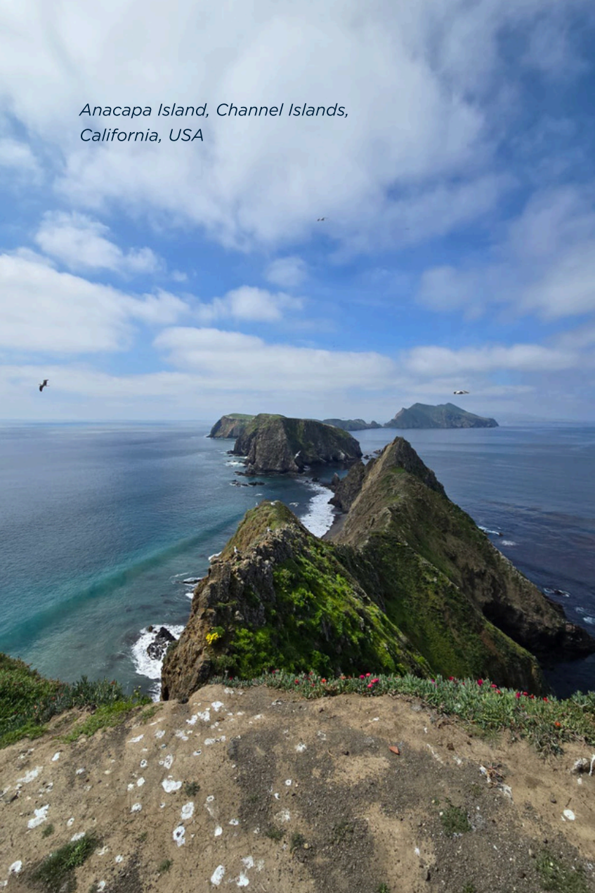
Anacapa Island, Channel Islands, California, USA