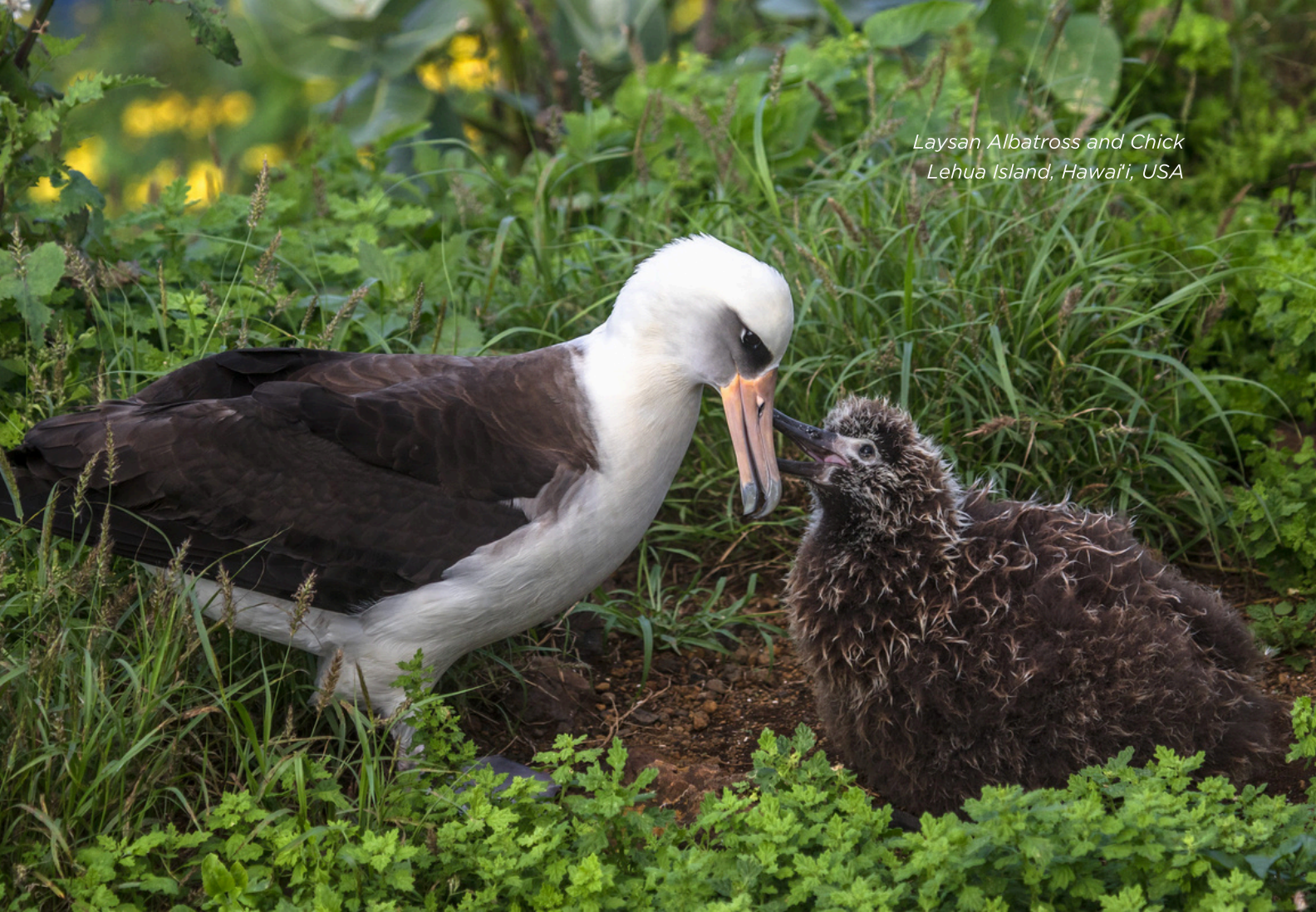
Laysan Albatross and Chick Lehua Island, Hawai'i, USA