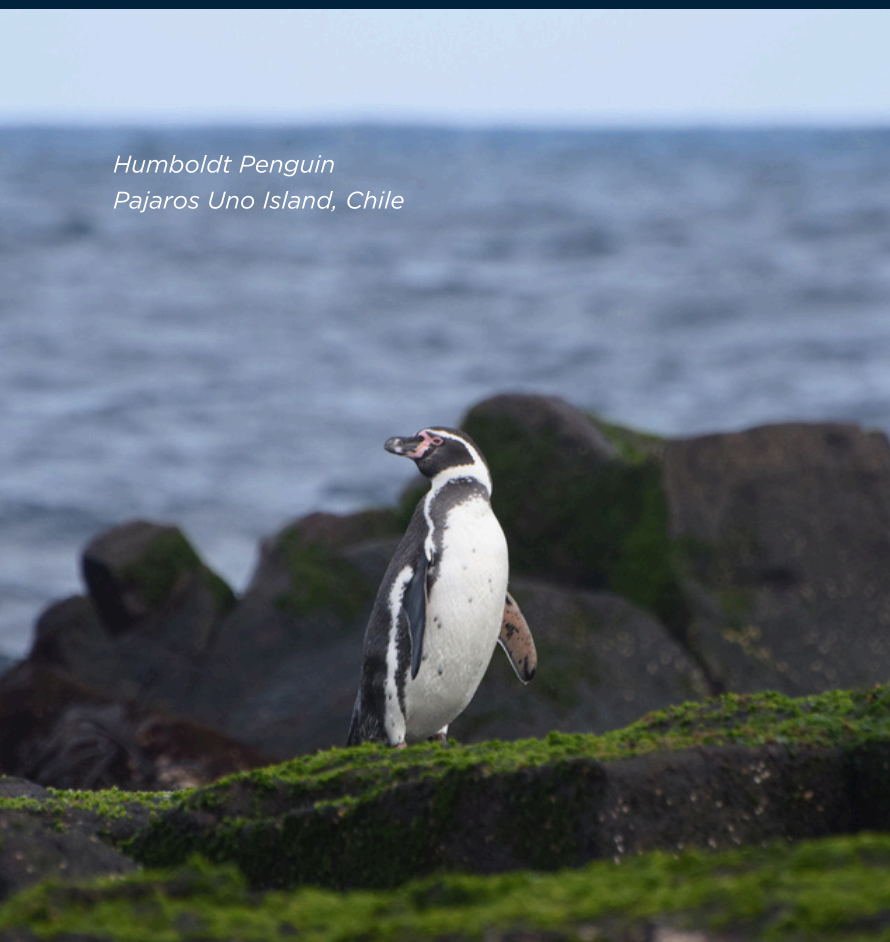
Humboldt Penguin Pajaros Uno Island, Chile