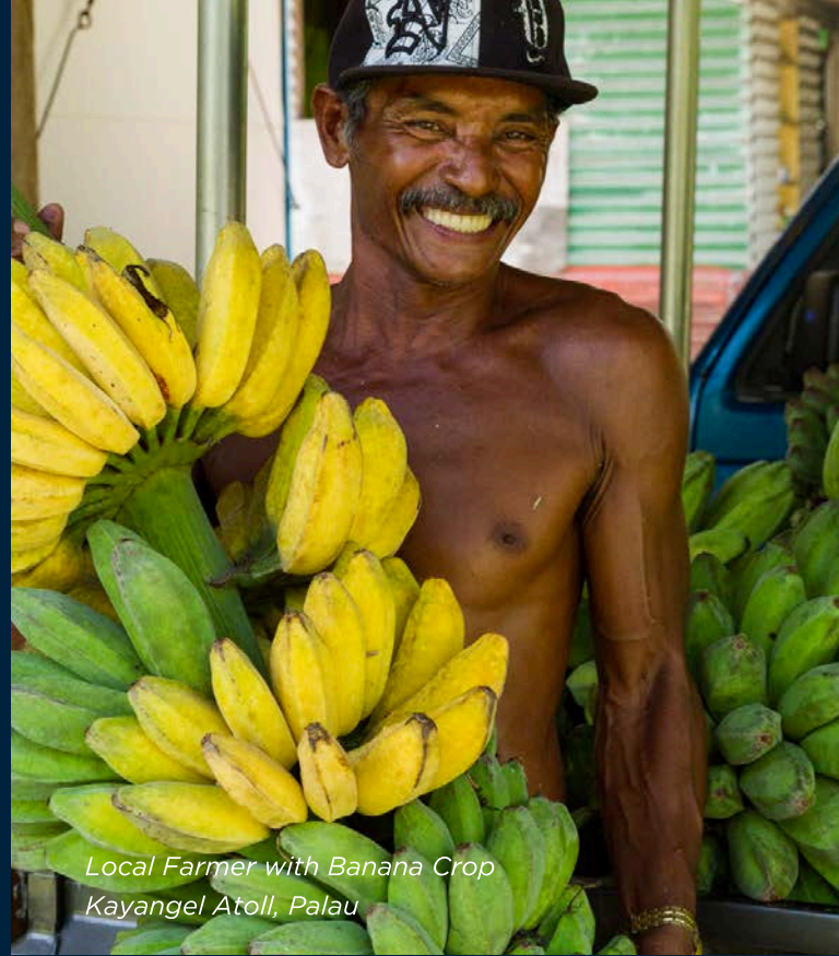
Local Farmer with Banana Crop Kayangel Atoll, Palau