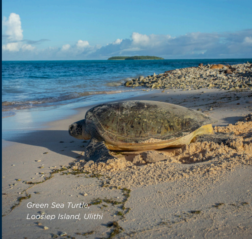
Green Sea Turtle, Loosiep Island, Ulithi