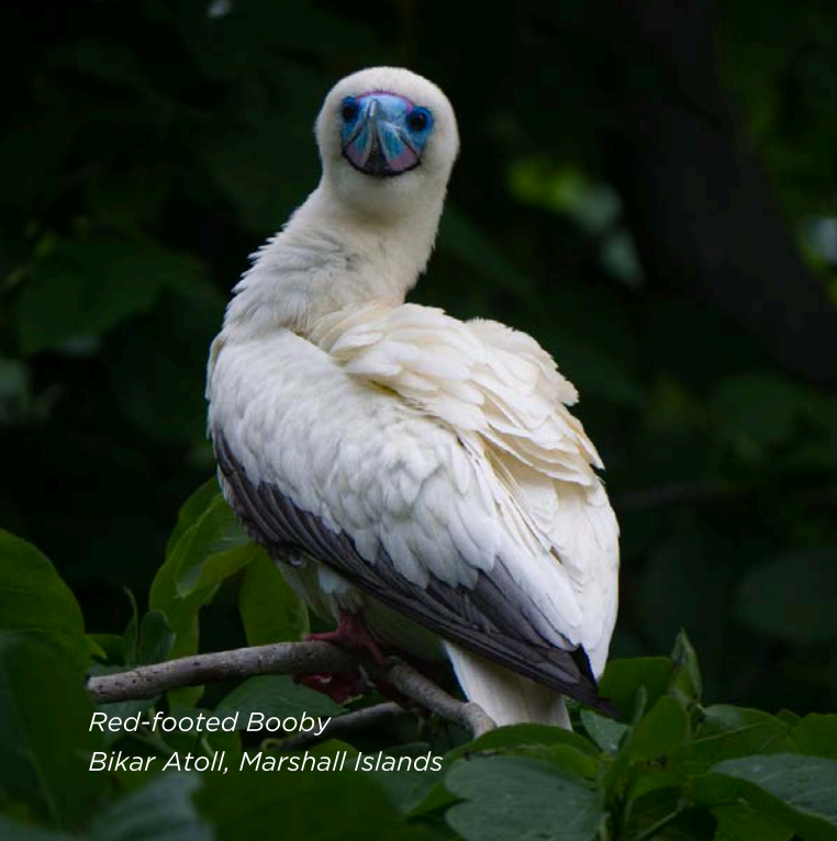
Red-footed Booby Bikar Atoll, Marshall Islands